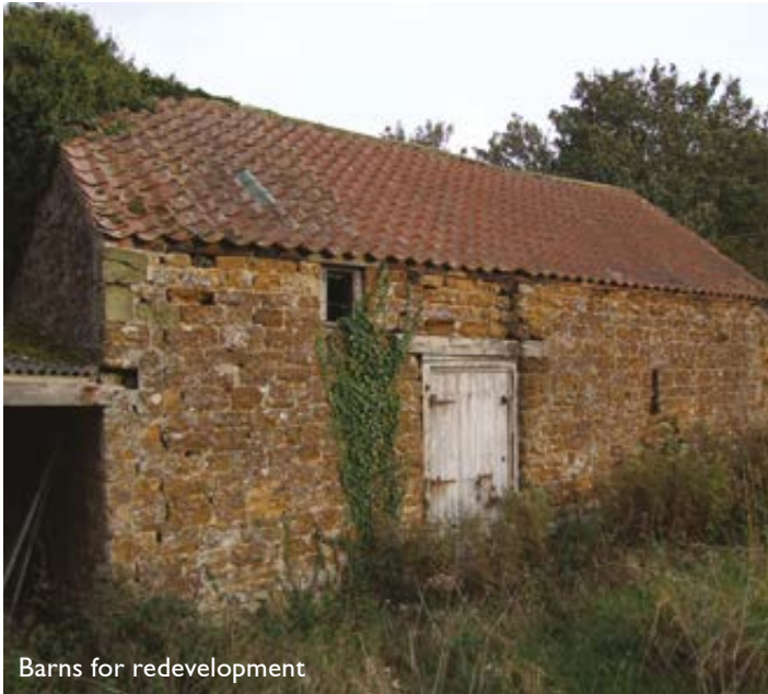
Barns for redevelopment