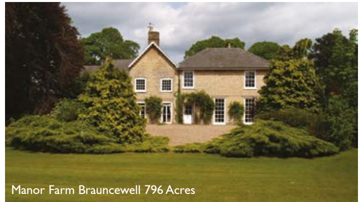
Manor Farm Brauncewell 796 Acres

"JHWalter have been absolutely brilliant. Not only did they sell the property smoothly but they also handled the farm machinery auction exceptionally well. We are very pleased with the people we chose to do the job and we're convinced that the project couldn't have been managed any better. Congratulations on a spectacular sale and thank you ever so much for your individual and professional service."