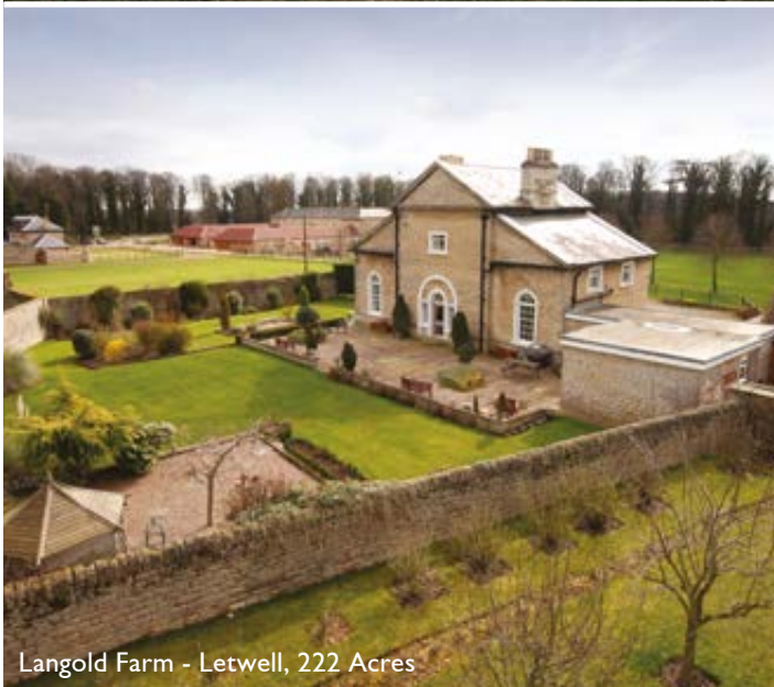
Langold Farm - Letwell, 222 Acres

"JHWalter have been absolutely brilliant. Not only did they sell the property smoothly but they also handled the farm machinery auction exceptionally well. We are very pleased with the people we chose to do the job and we're convinced that the project couldn't have been managed any better. Congratulations on a spectacular sale and thank you ever so much for your individual and professional service."