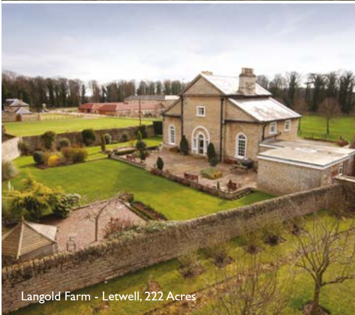
Langold Farm - Letwell, 222 Acres

"JHWalter have been absolutely brilliant. Not only did they sell the property smoothly but they also handled the farm machinery auction exceptionally well. We are very pleased with the people we chose to do the job and we're convinced that the project couldn't have been managed any better. Congratulations on a spectacular sale and thank you ever so much for your individual and professional service."