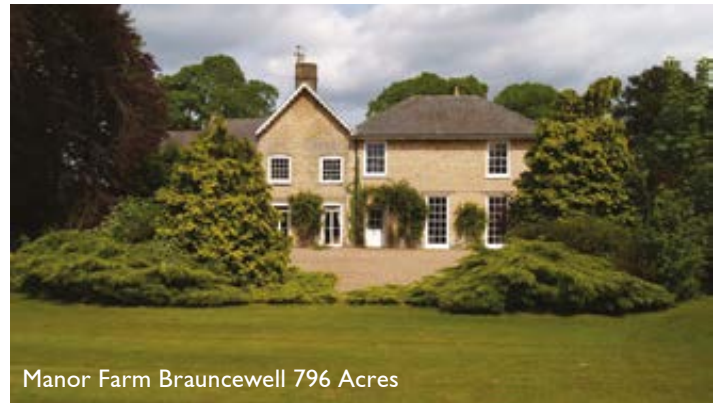
Manor Farm Braucewell 796 Acres

"JHWalter have been absolutely brilliant. Not only did they sell the property smoothly but they also handled the farm machinery auction exceptionally well. We are very pleased with the people we chose to do the job and we're convinced that the project couldn't have been managed any better. Congratulations on a spectacular sale and thank you ever so much for your individual and professional service."