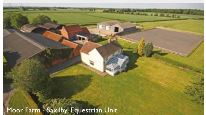
Moor Farm - Saxilby, Equestrian Unit