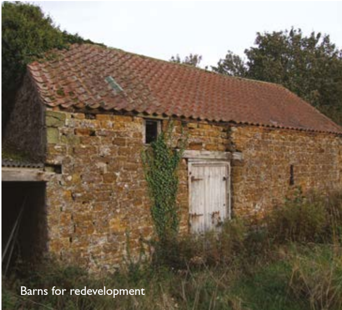
Barns for redevelopment