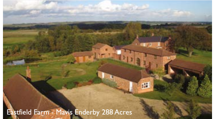
Eastfield Farm - Mavis Enderby 288 Acres

"JHWalter successfully marketed our farm and associated properties. We were impressed by their attention to detail both in recommending the selling price and production of the excellent sales brochure. They provided a thoroughly professional service and we would recommend them to anyone."