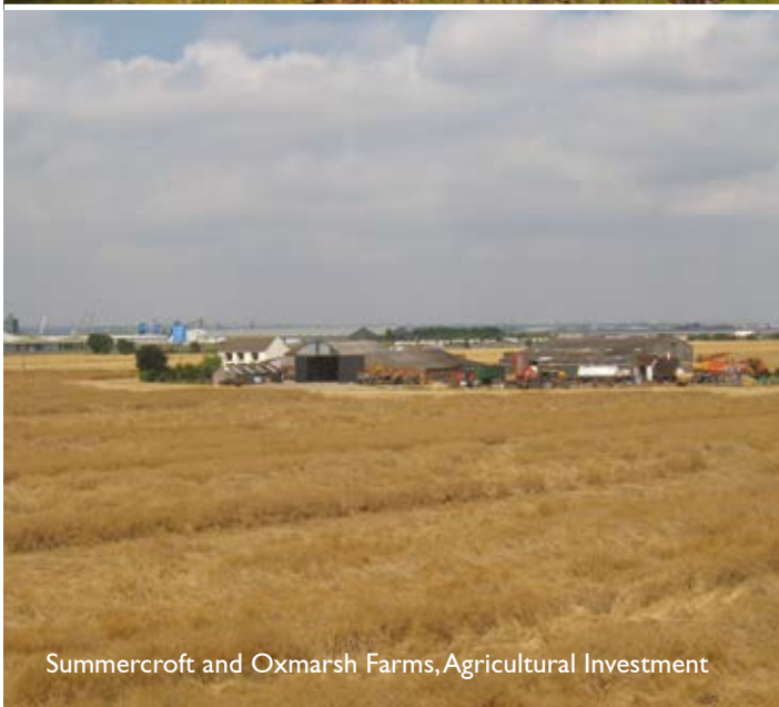
Summercroft and Oxmarsh Farms, Agricultural Investment

"JHWalter successfully marketed our farm and associated properties. We were impressed by their attention to detail both in recommending the selling price and production of the excellent sales brochure. They provided a thoroughly professional service and we would recommend them to anyone."