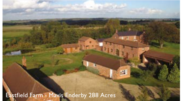
Eastfield Farm - Mavis Enderby 288 Acres

"JHWalter successfully marketed our farm and associated properties. We were impressed by their attention to detail both in recommending the selling price and production of the excellent sales brochure. They provided a thoroughly professional service and we would recommend them to anyone."