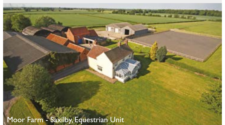
Moor Farm - Saxilby, Equestrian Unit