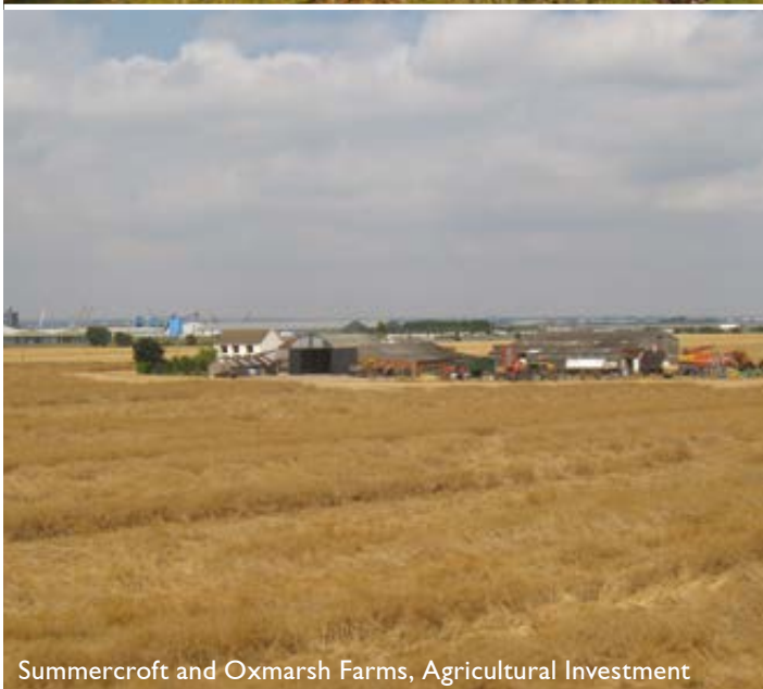
Summercroft and Oxmarsh Farms, Agricultural Investment

"JHWalter successfully marketed our farm and associated properties. We were impressed by their attention to detail both in recommending the selling price and production of the excellent sales brochure. They provided a thoroughly professional service and we would recommend them to anyone."