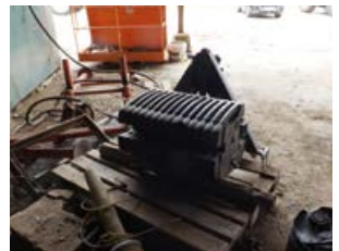
14 x 40kg tractor weights on A frame