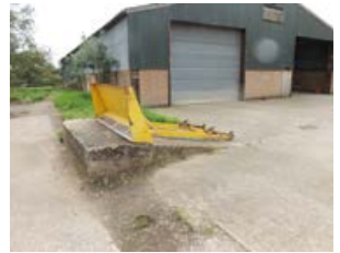
Grain pusher 10ft JCB bracket