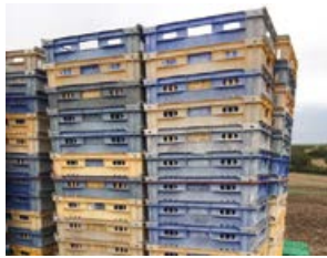
Qty of plastic vegetable storage boxes 60x40x24cms - more available by request