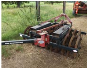
NRH Engineering plough press, 2012, 27 in rings, 72in width, ser no FP746