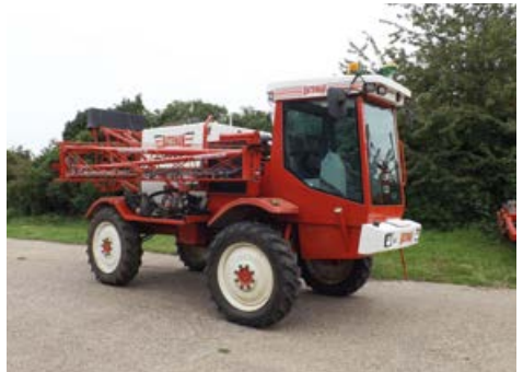
BATEMAN RB16, 2004, WA04 GUW, 9300hrs, 3,000lt, 24m, triplet bodies, inductor, fast fill pump, hydraulic track adjustment, JD light bar, 320/85R32