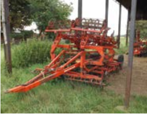
KONGSKILDE 4m Germinator trailed