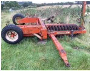
PARMITER heavy single press with hydraulic end tow kit