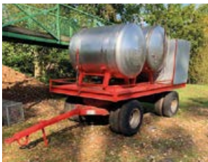
Water Bowser on 4 wheel trailer, 4000lts Stainless steel, spray locker, lights