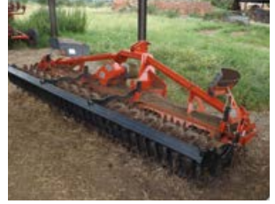
FRANDENT R403.22 4m power harrow, 2004