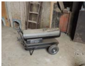
Diesel fired workshop heater ZB-K125, 37Kw