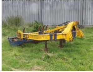
TWB 3m subsoiler 3 tines, with cultivator tines