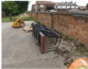
Hydraulic muck grab 7ft JCB brackets