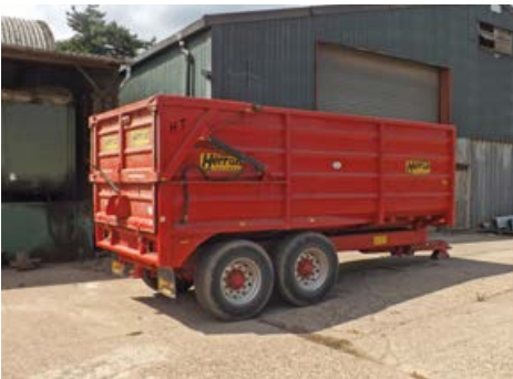
HERRON GS14, 2012, 14 tonne grain trailer, Hydraulic tailgate, sprung drawbar.