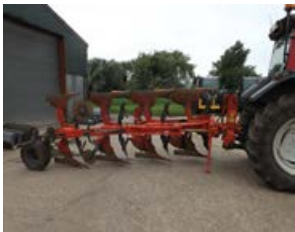
VOGEL & NOOT XMS-950 4 furrow plough, ser no 66636