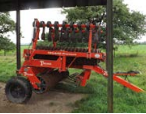
TWOSE FR3-640 prem 6m rolls, 2015, front levelling boards ser no 640CB4L