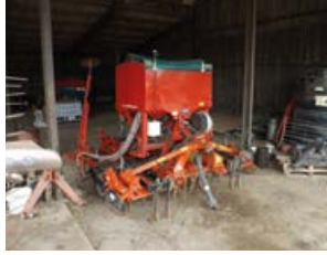
FRANDENT 3m Power Harrow Combi drill R303-19, 2015, GPS