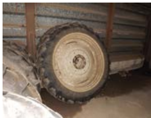
Set wheels and tyres 11.2 R28