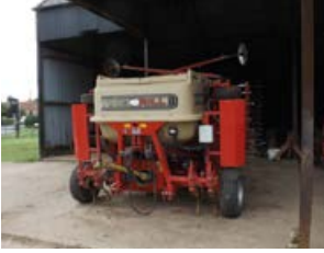
WEAVING tine drill 4.8m, done 1100 acs