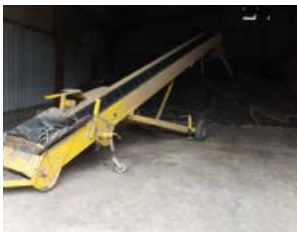
FYSON rubber belt elevator, 24ft c/w 9ft extension