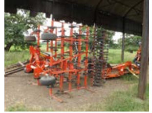
GUTTLER 5m Supermaxx springtine drag, ser no J450358