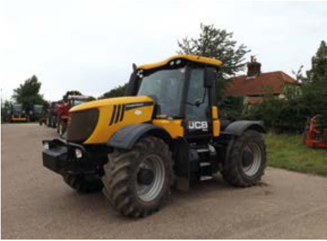
JCB Fastrac 3230, 2011, FX61 HHS, 3545 hrs, P Tronic, 3 Electric spools, 540/65R30