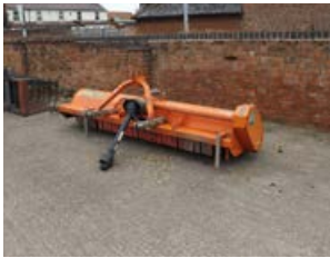
AGRIMASTER KN 280 2.8m topper, 2013