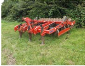
SUMO Trio 3m, 2009, ser no 09223