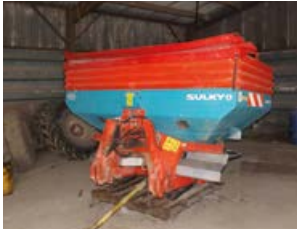
SULKY RECO DPX28 spreader, 2014, GPS controller, hopper extension and cover