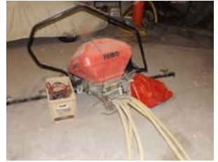
SUMO VI pneumatic seeder, 2012, Radar controlled, hopper access steps