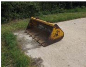
SANDERSON 6ft digger bucket JCB brackets