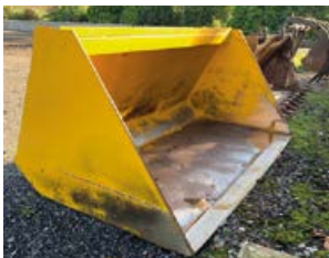
JCB Q fit grain bucket 2m 3