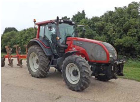
VALTRA T121, 2007, FX57 HRJ , 3800 hrs, 130hp chipped to 160hp Front linkage, 3 spools, 18.4R38 rear, 14.9R28 fr