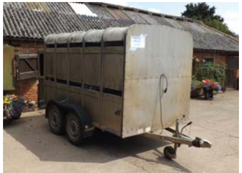
IFOR WILLIAMS TA510G livestock trailer, twin deck, Ser no 174114