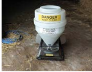
BULLOCK T24 slug pellerter, 2017