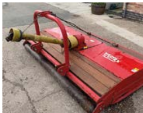
VOTEX Rolasport 2.2m wide mower rollers front and rear