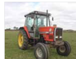
Massey Ferguson 3070 autotronic 2wd tractor