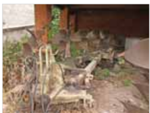
Dowdeswell DP7E 5 furrow rev plough Serial No - 871434725