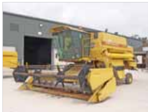
New Holland TX34 Combine Harvester 17ft, fixed sieve, straw chopper, header trailer. N675AFV, 2550 drum hrs