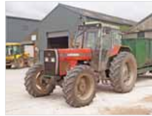
Massey Ferguson 399 4wd Tractor 3 point linkage, pick up hitch, 2 spools. Tyres - 340/85 R28 front 16.9 R38 rear L835YFE, 6,367hrs