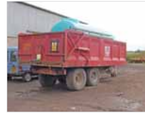
DJS 10t steel mono tipping trailer Tandem axles, hydraulic tail door, grain chute.