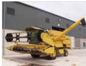
New Holland TX34 Combine Harvester 17ft, fixed sieve, straw chopper, header trailer. N657JFV, 2550 drum hrs