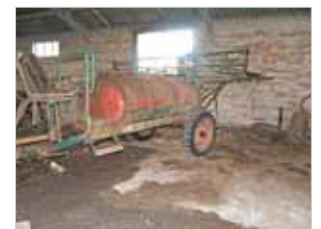
Moteska 12m sprayer