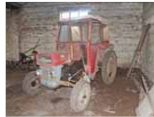
Massey Ferguson 135 2wd HTL981N