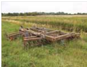
Parmiter Utah disc harrows Rear draw bar