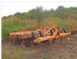
Simba Xpress 3m mounted cultivator c/w 3m ST bar