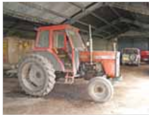
Massey Ferguson 290 2wd 3pt, pick up hitch. C704 MFE, 6,187 recorded hrs