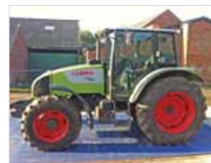
Claas Celtis 446RX tractor