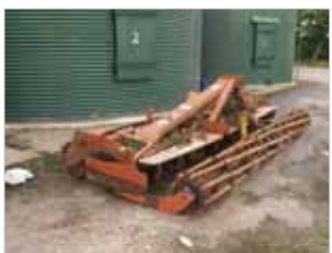
1999 Kuhn HR4002D 4m power harrow, c/w crumbler roller Machine no. 960931