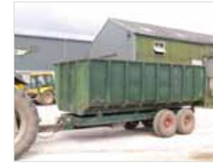
ETC Hercules steel mono tipping trailer Tandem axles.

Weeks 7t tandem axle drop side tipping trailer.