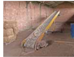
Fyson 27ft Elevator Single phase, extension with manual hydraulic angle and swing, potato hopper. Serial No - FE4010