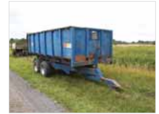
AS 10t Steel mono tipping trailer