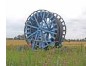
Wright Rain 19/360 irrigation reel (Reel only).