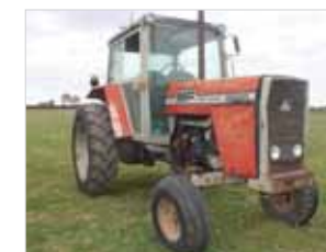
Massey Ferguson 2620 2wd tractor