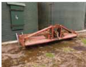
2001 Concept 4m power harrow Packer roller.