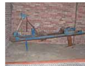
Ransomes single leg mole drainer

Amazon ZA-M twin disc fertiliser spreader 12/18/24m discs