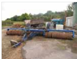
Lawrence Edwards 6m hydraulic folding rolls Breaker rings