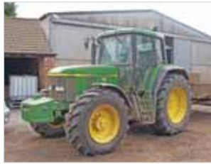
John Deere 6910 4wd Powerquad, 2 spools, pick up hitch, front fenders, weight. Tyres - 340/85 R28 front 520/85 rear V108YFE, 6,332hrs