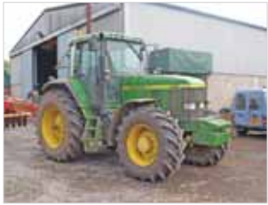
John Deere 7810 4wd Powershift, 3 spools, pick up hitch, weight, front fenders. Tyres - 480/70R 28 front 20.8 R38 rear P658TFV, 4,060hrs