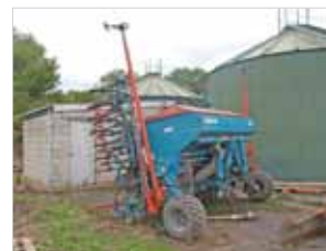
Reco Sulky SPI Solo Reg-u-line 6m 6m drill c/w following harrow and bout markers.