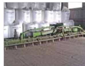
Dowdeswell 7m heavy duty power harrow