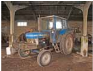
Ford 4610 2wd 3pt, pick up hitch. A62TFW, 5,207 recorded hrs