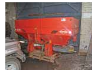
1998 Kuhn MDS1 I41 Twin disc fertiliser spreader.